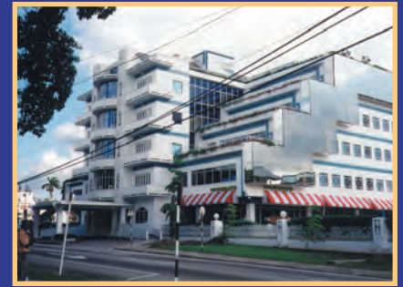
Port of Spain, Trinidad, West Indies