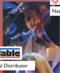
Reliable National Distributor