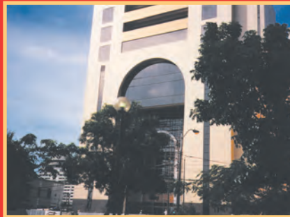
Port of Spain, Trinidad West Indies

Vipond provided design, material as well as project management.