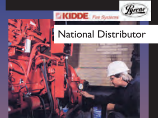
KIDDE Fire Systems Hyvac National Distributor