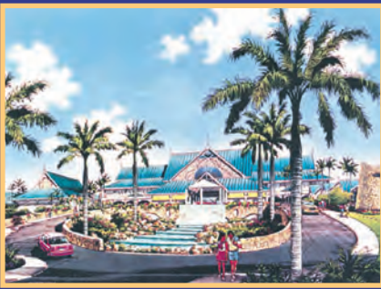
Tobago, West Indies